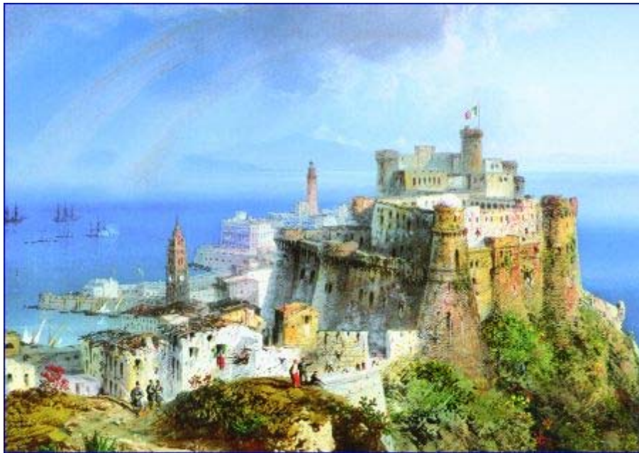
Siege of Gaeta, of Carlo Bossoli

In 2011 Italy celebrates the 150th Anniversary of Italian Unification and closely connect to that, the 150th Anniversary of Constitution of the Regia Marina, both events related to Gaeta and it's territory.